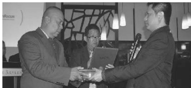
UAP MAGS CHAPTER

JULY 25, 2014 – BAYLEAF HOTEL, INTRAMUROS MANILA