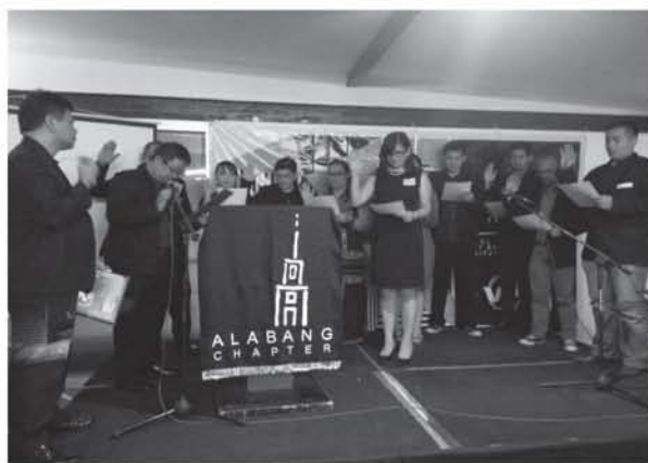
ALABANG CHAPTER JULY 30, 2014 FULLY BOOKED HIGH STREET BONIFACIO GLOBAL CITY