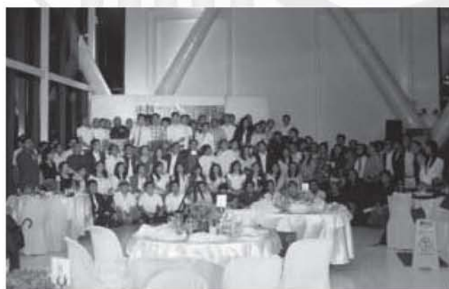
MAKATI CBD CHAPTER JULY 17, 2014 EVENTS HALL, CENTURY MALL MAKATI CITY