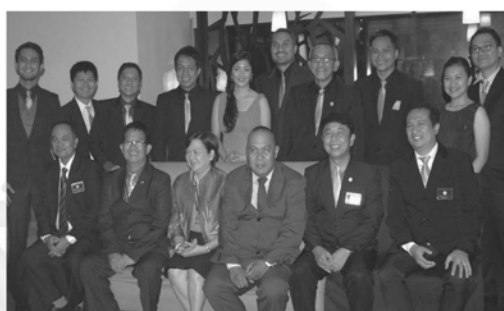
MANILA CORINTHIAN CHAPTER