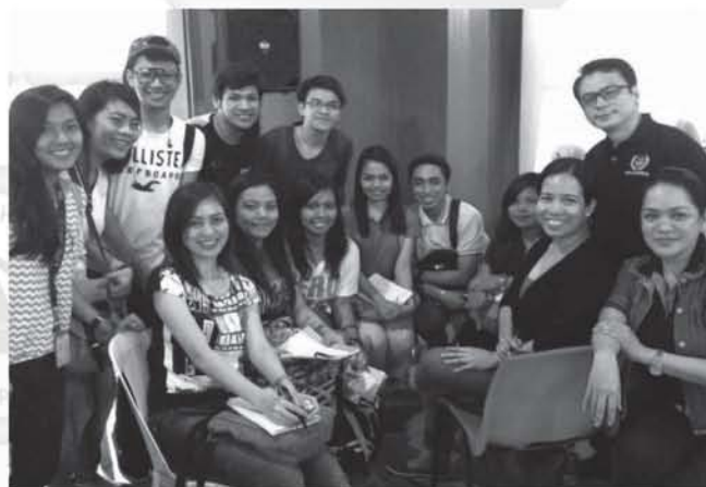
ARCHITECT-MENTORS & STUDENT PARTICIPANTS