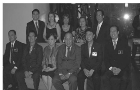
MANILA INTRAMUROS CHAPTER