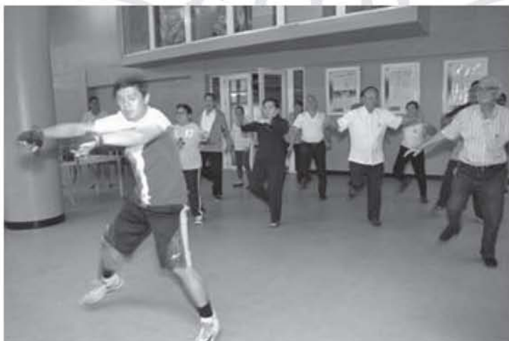
Anti-Oxidants Health Talk (1st GMM, July 5, 2014) Zumba Dance Exercise (2nd GMM, August 2, 2014)