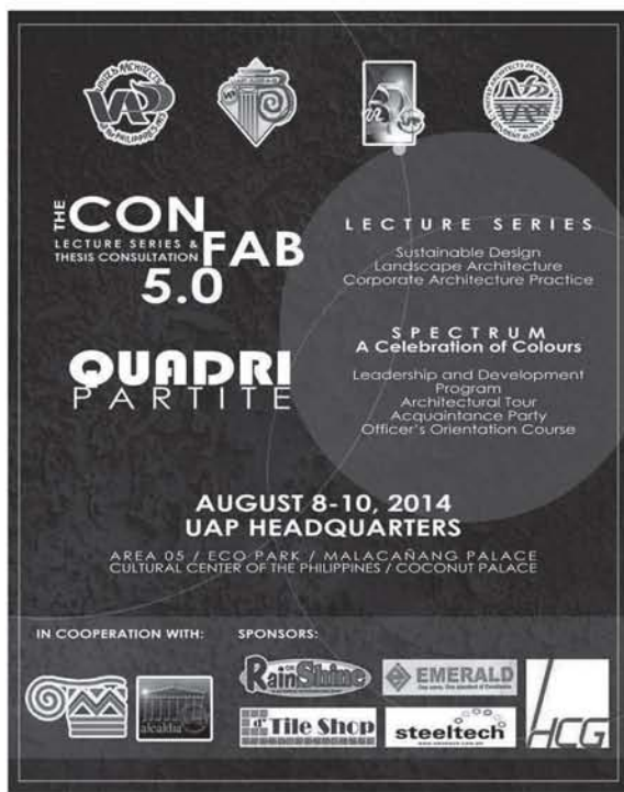
THE UAPSA CONFAB 5.0 QUADRI PARTITE AUGUST 8-10, 2014 UAP HEADQUARTERS