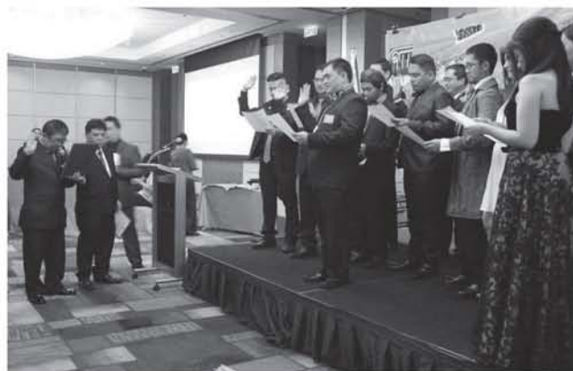
MAKATI CHAPTER JULY 31, 2014 MAKATI SHANGRILA HOTEL MAKATI CITY