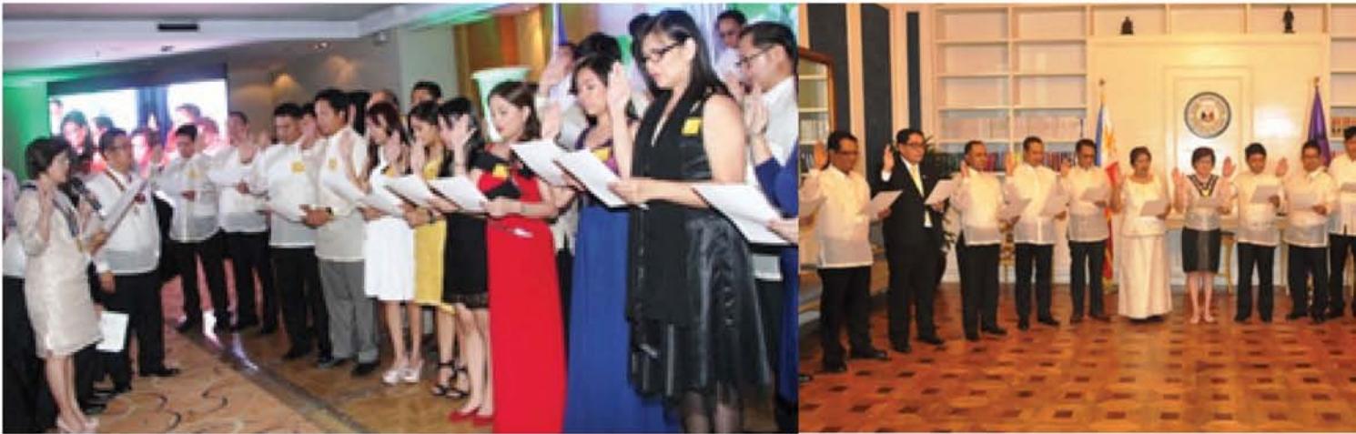
NBD Oathtaking at Supreme Court with