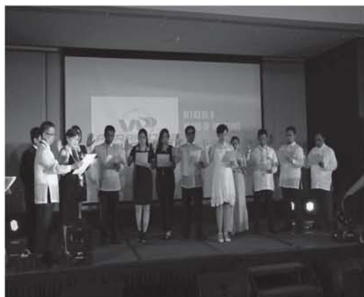
PARANAQUE PALANYAG CHAPTER JULY 6, 2014 CRIMSON HOTEL ALABANG, MUNTINLUPA CITY