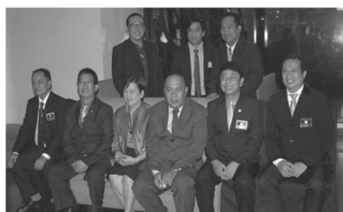
MANILA LA SOLIDARIDAD CHAPTER