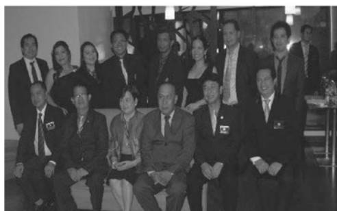
MANILA MAHARLIKA CHAPTER

JULY 25, 2014 – BAYLEAF HOTEL, INTRAMUROS MANILA