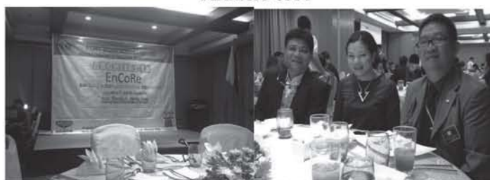
FORT BONIFACIO CHAPTER AUGUST 14, 2014 HOLIDAY INN SUITES PALM DRIVE, MAKATI CITY