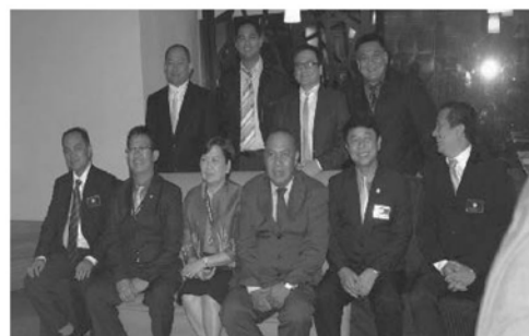
MANILA MAYNILAD CHAPTER