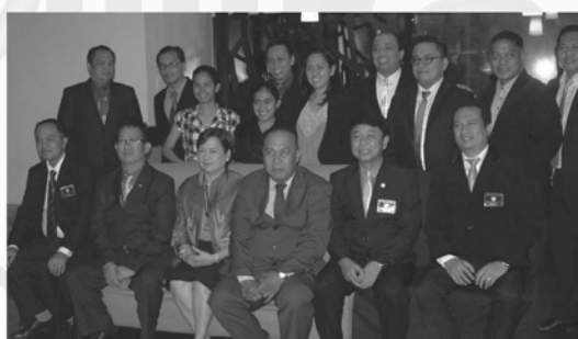
MANILA ALCALDIA CHAPTER