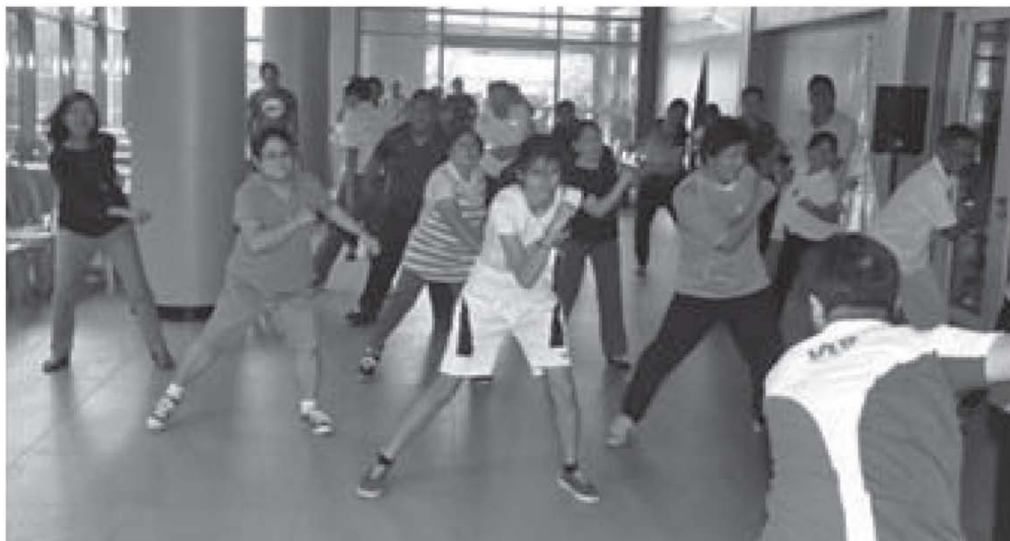
Zumba & Hip Hop Dance Exercise (3rd GMM, September 6, 2014)