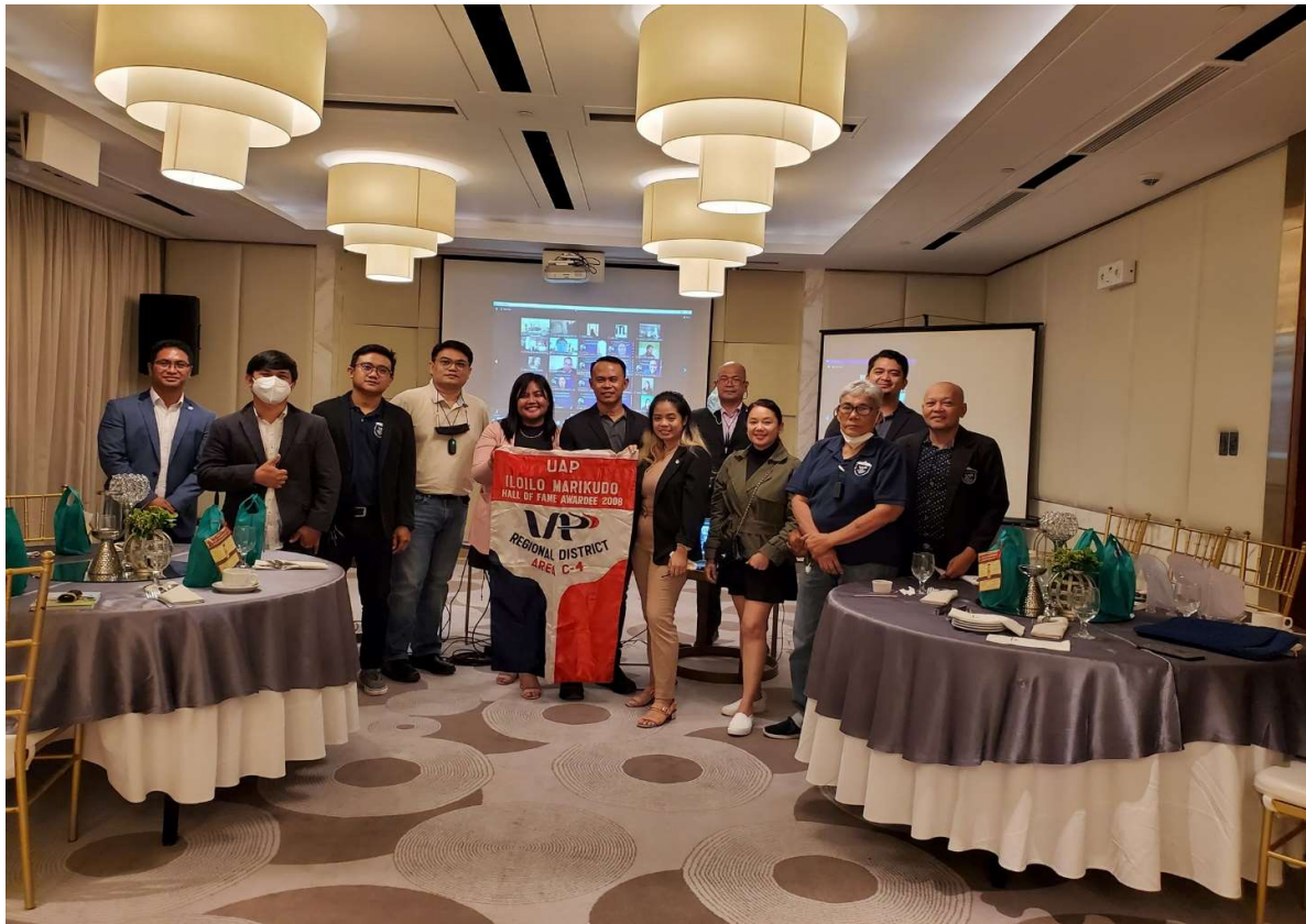
ILOILO MARIKUDO CHAPTER JOINS THE DISTRICT INDUCTION ON NOV, 12,2021. TOGETHER WITH THE DISTRICT OFFICERS, INCOMING MARIKUDO CHAPTER OFFICERS AND NEW MEMBERS.