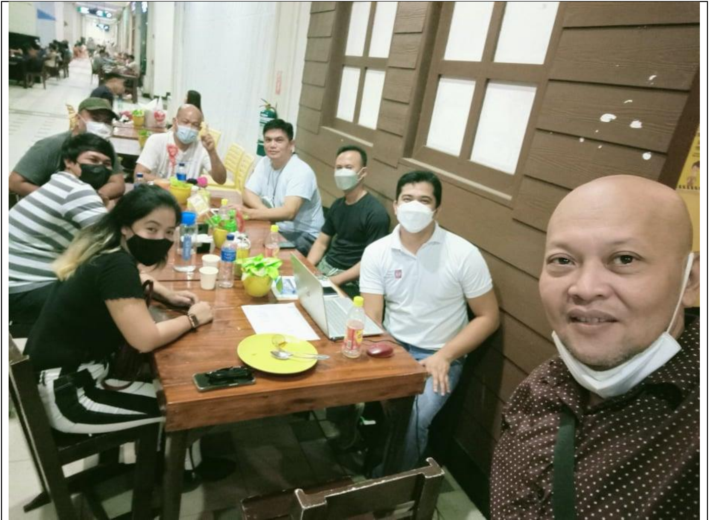
ILOILO MARIKUDO CHAPTER HAD THE 8 TH MONTHLY BOARD MEETING. THE OFFICERS AND PP'S FINALIZED THE DRAFT FOR THE MEMBERSHIP GUIDELINES.