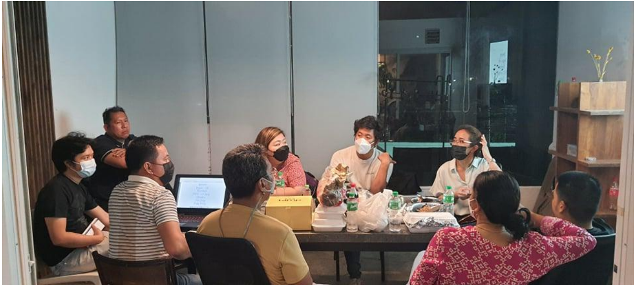
The Council finalizing the games for the Christmas Party.

The council worked on the finalization of the Christmas Party program list.