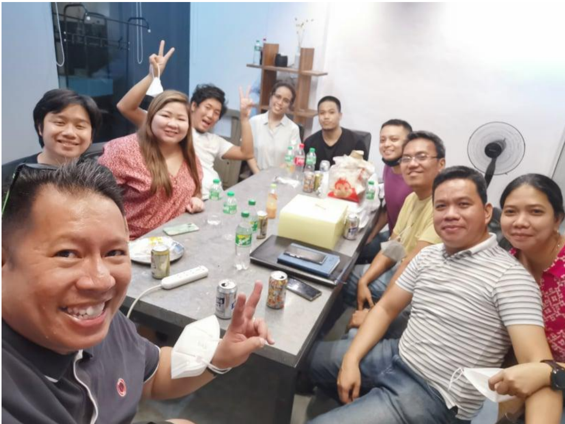
The Council selfie before dinner.