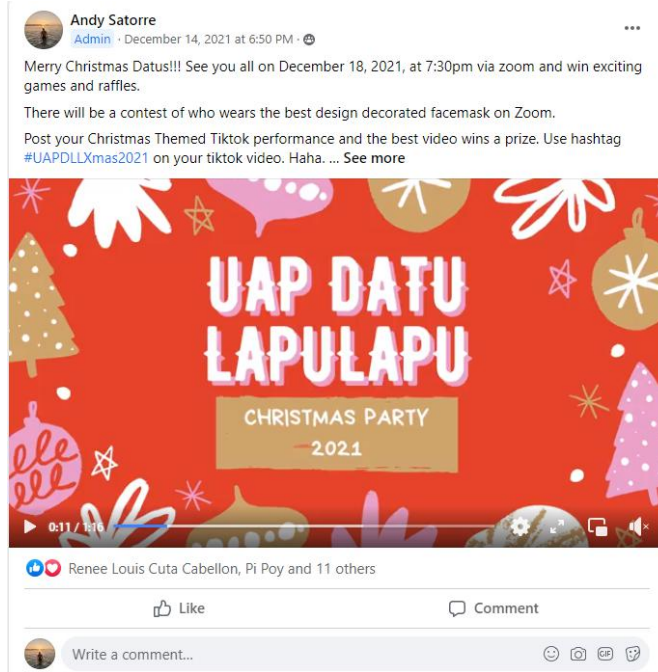
Promotional Poster and Promotional Video for the 5 th GMM